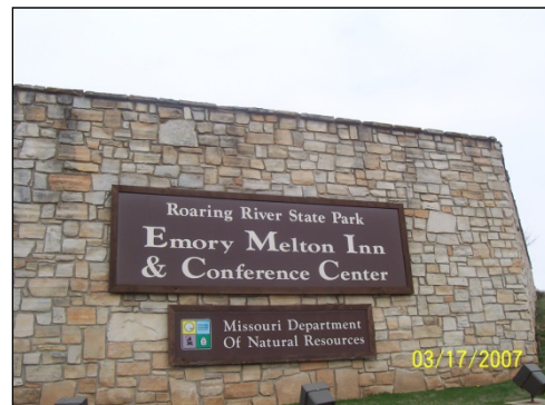
Inn & Conference Center sign on rock wall at entrance