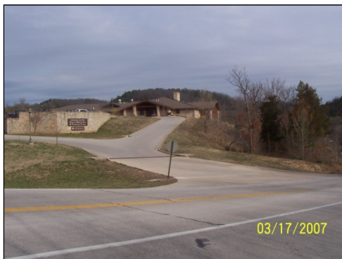
Entrance to Inn & Conference Center seen from Highway 112

Look for these visual landmarks for your left turn into the entrance of the Roaring River Inn & Conference Center: