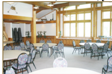
Main Meeting Room